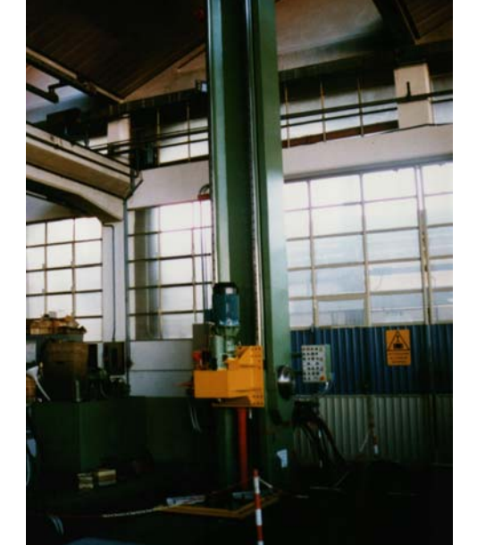
Machine characteristics of length and diameters can be made in accordance with the requirements of the customer.

Also in production a vertical lapping machine up to 5 meters