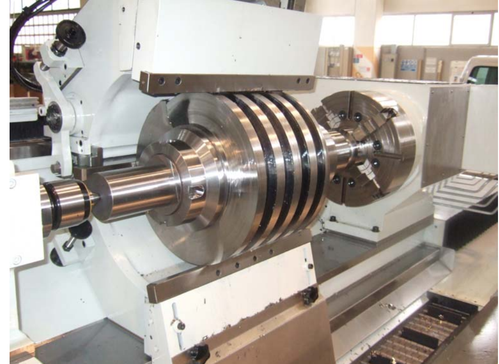
Rotor of Ø 420 mm in stainless steel type 17-4PH (320HB) machined by disc cutter with inserts in one passage

The CNC Siemens 840D allow the easy Execution of screws by SAPORITI's especially developed customized working mask "customer friendly".